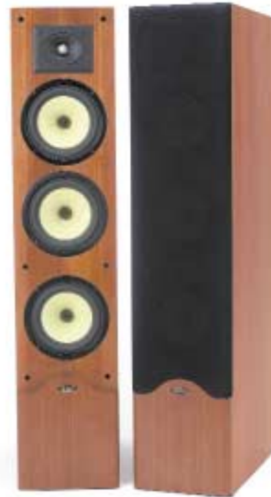
DRAGON MARK III SE