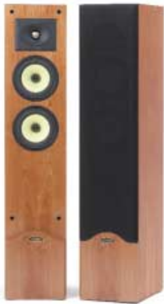
HARLEQUIN MARK III SE