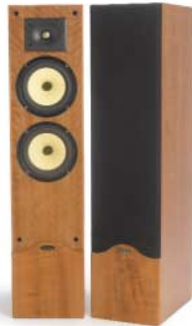
WIZARD MARK III SE