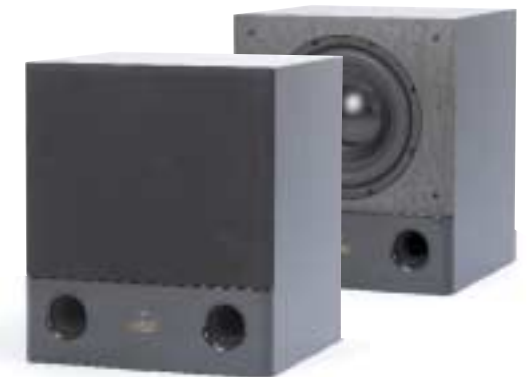
THOR MARK IV